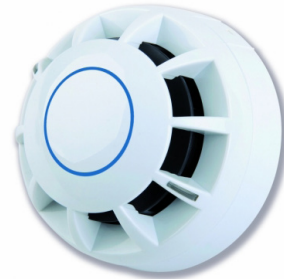
Illustration shows a CA414/CON CAST multisensor detector mounted on a CA408/CON base. The multisensor has a blue colour coded ring.